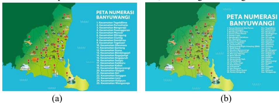
Figure 3. (a) Initial Design of the “Peta Numerasi Banyuwangi” Game Board, (b) Improvement Results of the “Peta Numerasi Banyuwangi” Game Board

Based on expert advice, the “ Peta Numerasi Banyuwangi ” game board, which was originally without descriptions of tourist attractions, was changed as in Figure 3 below.