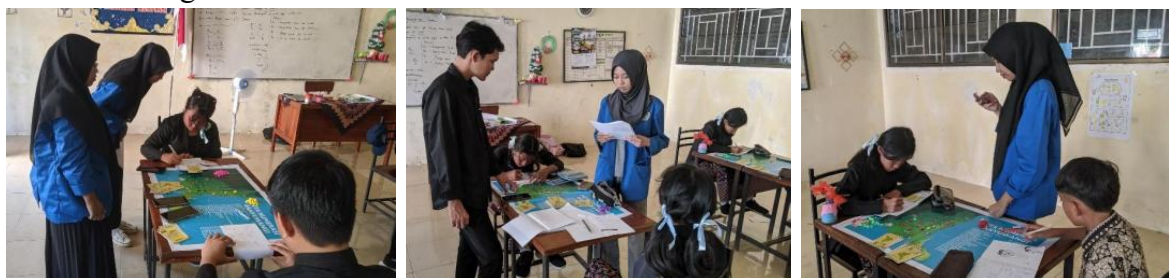
Figure 4. Documentation of the “Peta Numerasi Banyuwangi” Learning Trial

Implementation was carried out at SMPK Bakti Rogojampi Banyuwangi. Respondents who were product users consisted of 6 students ( S_1, S_2, S_3, S_4, S_5, S_6 ) class VII who had previously received proportion material. Some documentation of implementation activities is presented in Figure 4 below.